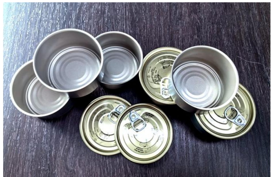
Application : Suitable for the food industry