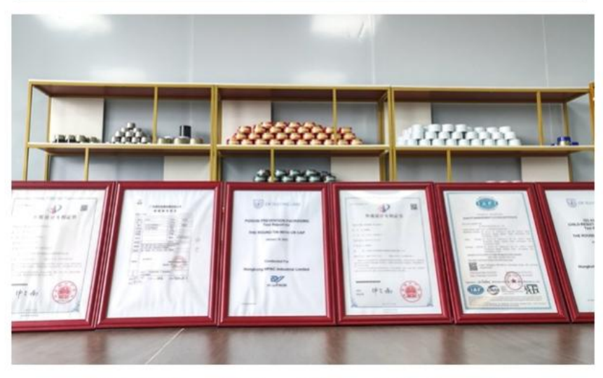
ISO 9001 SGS FDA Patent certificate

Hi-Pack Industry Co., Ltd. Certificate display