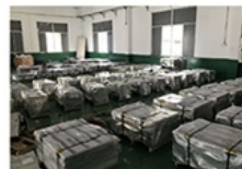
3. printed tinplates