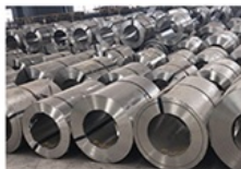
1. raw materials