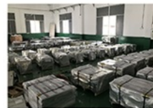
3. printed tinplates