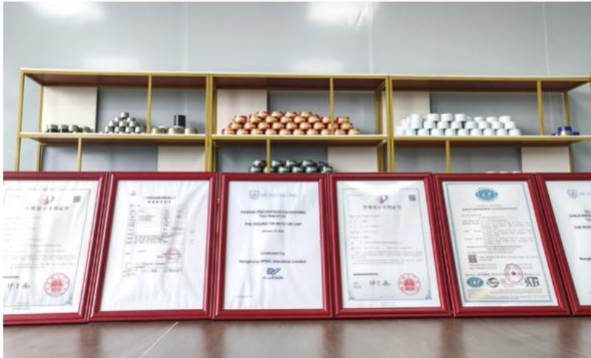
ISO 9001 SGS FDA Patent certificate